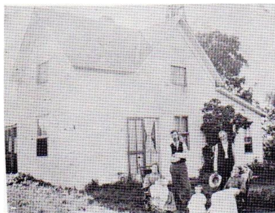
The Martin home, north of Falls City